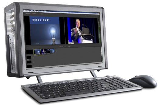
PSAV Multicaster based on the NextComputing Radius portable computer, running Telestreaming Wirecast software

To learn more about NextComputing's line of portable workstations, visit www.nextcomputing.com/products/portable-workstations/