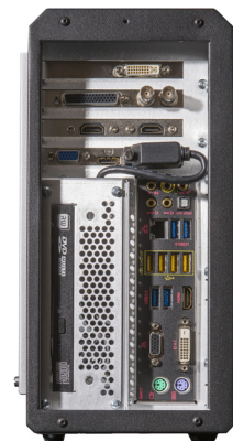
Side view of the Multicaster showing the variety of source inputs, allowing the system to be used for many types of events